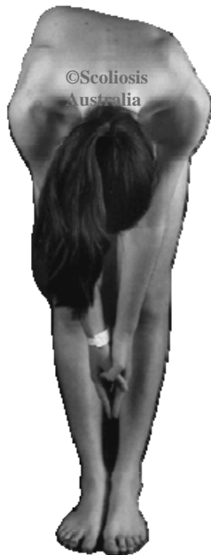
The Forward Bend Test

Apart from the outward signs with a teenager standing as illustrated, the reliable Forward Bend Test is used in the diagnosis of scoliosis. This simple visual examination requires the teenager to stand with the feet together and parallel and bending forward as far as she can go with the hands, palms facing each other, pointed between the two big toes. In scoliosis, one side of the upper chest (thoracic) region or the lower back (lumbar) region will be more than 1cm higher than the other. The prominence is most often on the right side in the thoracic region. If the difference between the two sides is less than 1cm, it is highly unlikely that a significant curvature is present and the difference is simply due to asymmetrical growth of the two sides of the body. This is called torso asymmetry and is of no significance.